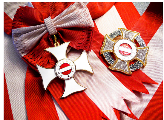
► Grand Cross and the star

The ribbon of the order was red-white-red, from the national flag of Austria.