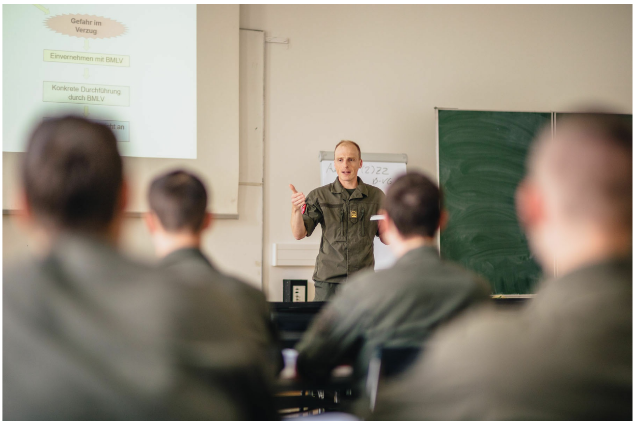
► In a classroom

This six-semester bachelor's degree programme in Military Leadership is the academic part of the officer training. From a broad spectrum of social sciences and humanities, the officer cadets learn what they need to improve their military leadership skills. For example, education and psychology to internalise the human side of leadership; law and economics; languages - especially English and French - to be fit for international missions. The emphasis is on tactical training at battalion and company level.